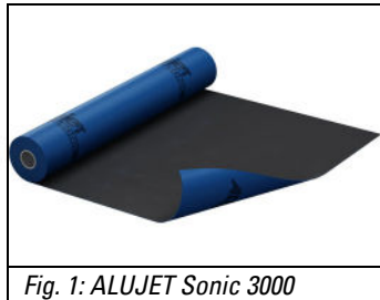
Fig. 1: ALUJET Sonic 3000